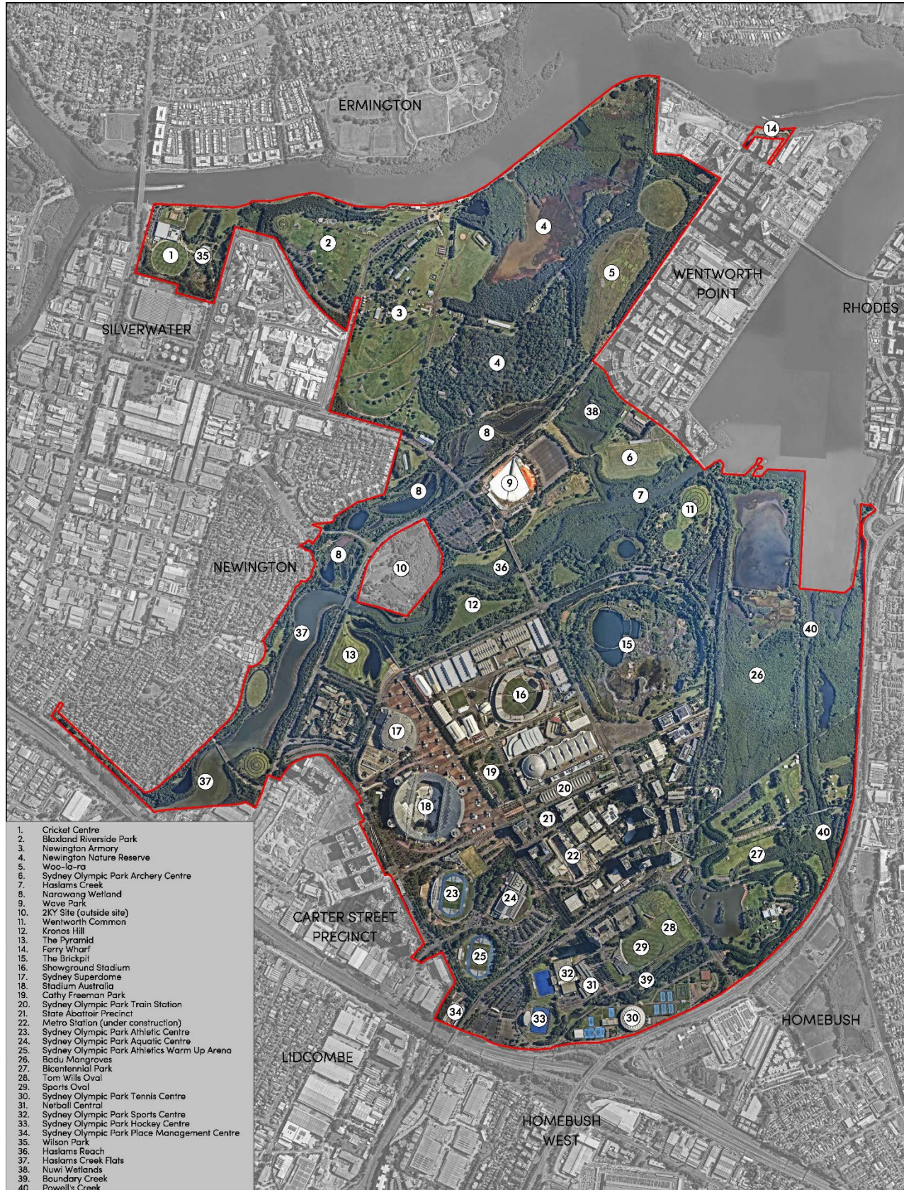
Figure 1 Land to which the Environmental Guidelines applies outlined in red

These Guidelines apply to land shown in Figure 1, being Sydney Olympic Park.